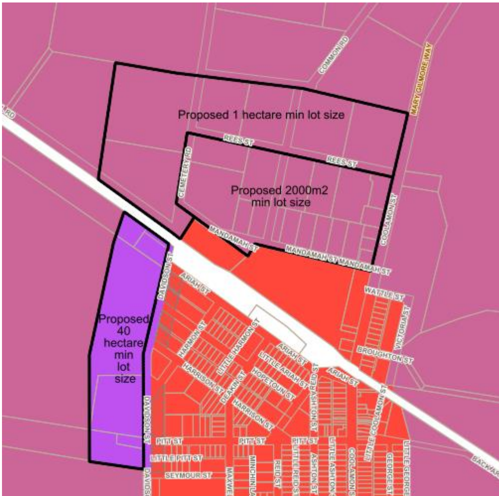
Figure 4: Proposed new minimum lot size boundaries

Adjoining land uses to the proposed R5 Large Lot Residential zone and RU5 Village zone are low intensity cropping and grazing. These are typical land uses that are expected in a rural village location and no land use conflicts would be expected.